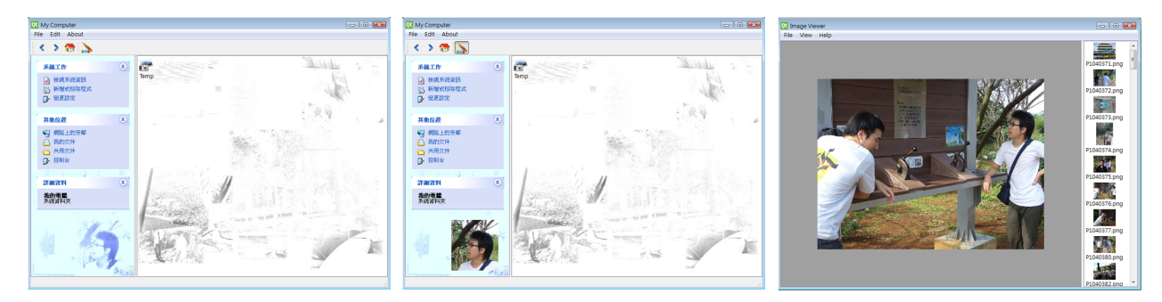
Figure 1: Left: inactive status. Middle: mouse hover one ROI under active status. Right: click one selected ROI to view the whole picture.